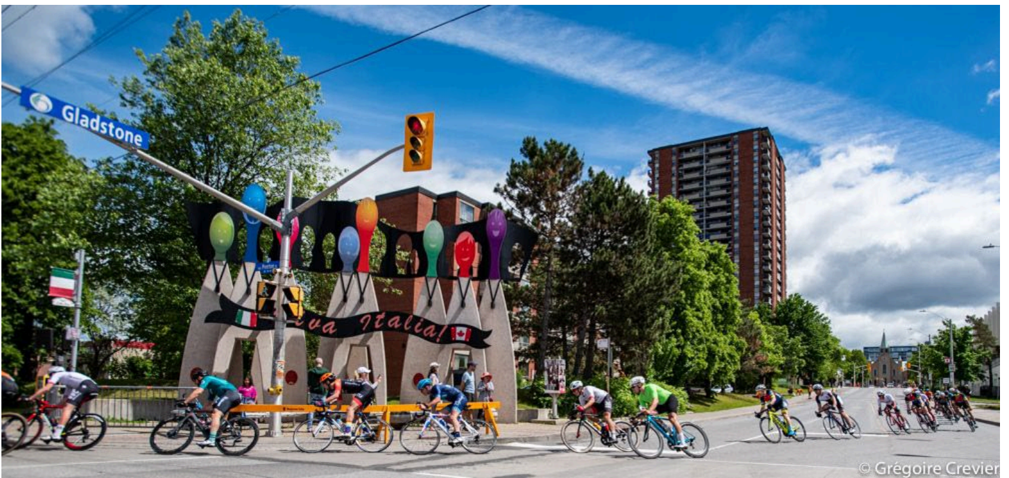
📷 Greg Crevier